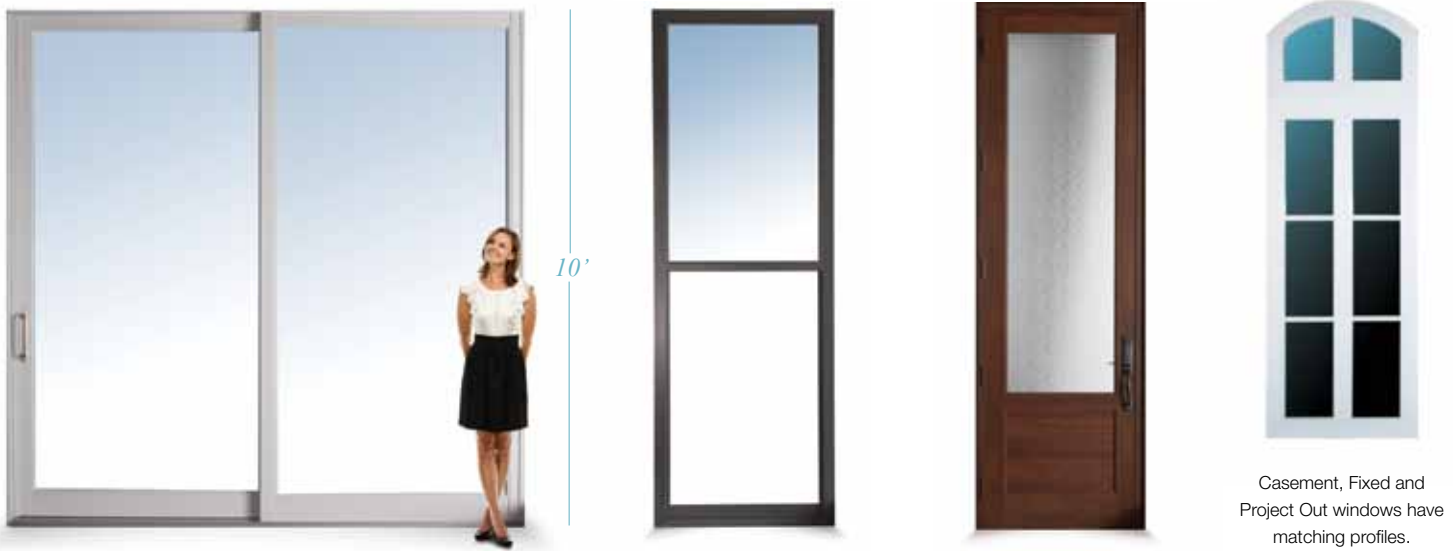
Casement, Fixed and Project Out windows have matching profiles.

that demand beautiful, unobstructed views without sacrificing protection. 10 foot tall windows are a tall order for other manufacturers to meet.